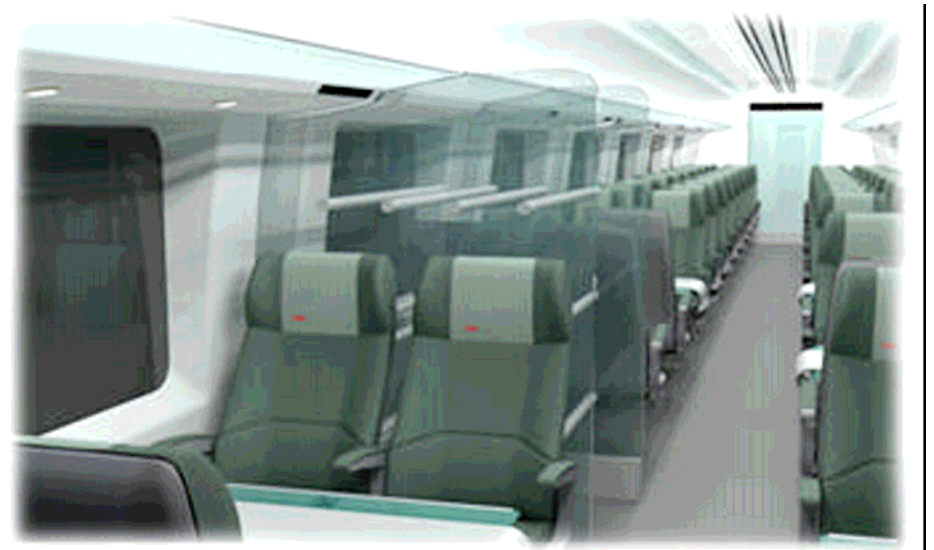
High speed systems in Austria